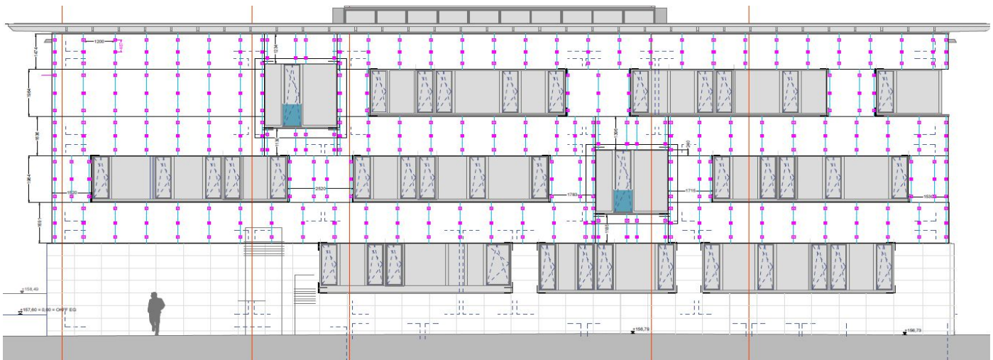
Installation-plan reference facade of the certified component